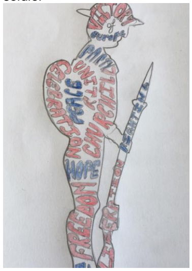
Esme – newspaper report celebrating VE day