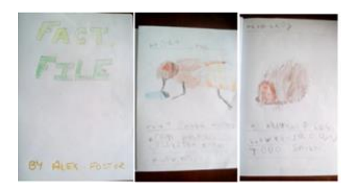
Alex's fact File